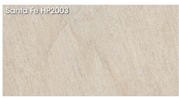
24" x 48" 1 cube = 26 pcs, 201.50 SF, 1950 lbs