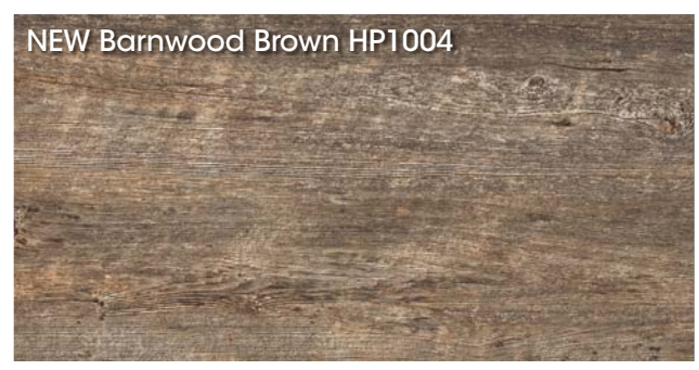
16" x 48" 1 cube = 54 pcs, 279 SF, 2635 lbs