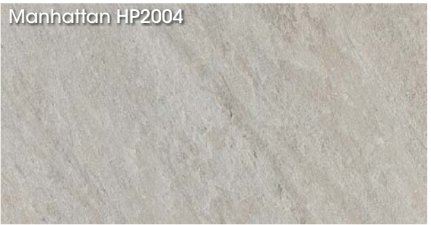
24" x 48" 1 cube = 26 pcs, 201.50 SF, 1950 lbs