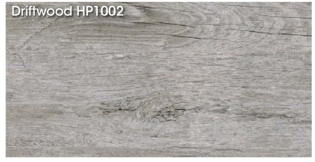
12" x 48" 1 cube = 48 pcs, 186 SF, 1725 lbs