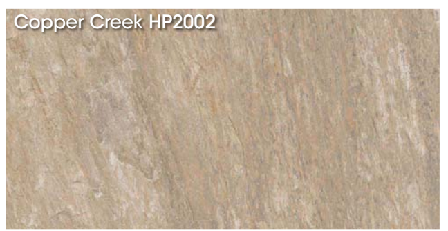
24" x 24" 1 cube = 64 pcs, 248 SF, 2335 lbs