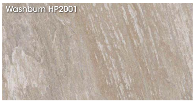
24" x 24" 1 cube = 64 pcs, 248 SF, 2335 lbs