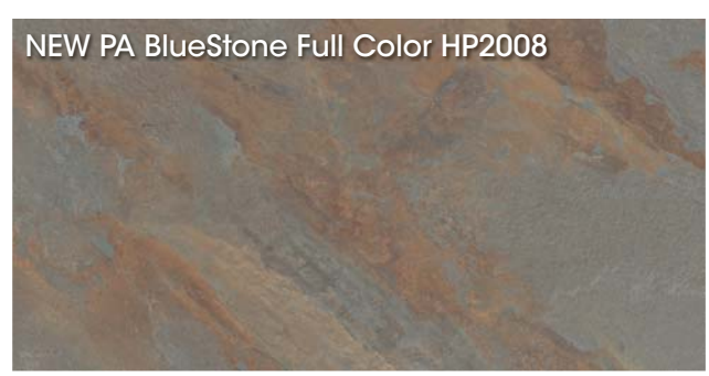
24" x 48" 1 cube = 26 pcs, 201.50 SF, 1950 lbs*