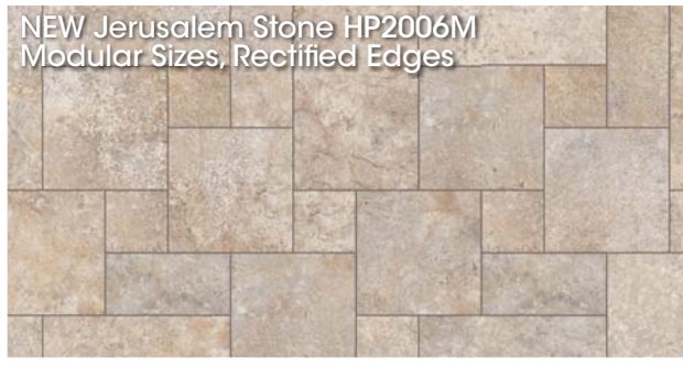
8^{\prime\prime} x 8^{\prime\prime} , 8^{\prime\prime} x 16^{\prime\prime} , 16^{\prime\prime} x 16^{\prime\prime} x 24^{\prime\prime} with Rectified Edges** Four sizes packaged together in 1 cube. Sold in full cubes only. 1 cube = 144 pcs, 186 SF, 1665 lbs*

* The 16" x 32" Jersusalem Stone unit cannot be laid with the Jersusalem Stone Modular units.