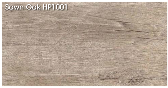
12" x 48" 1 cube = 48 pcs, 186 SF, 1725 lbs