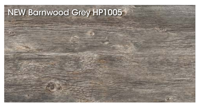
16" x 48" 1 cube = 54 pcs, 279 SF, 2635 lbs