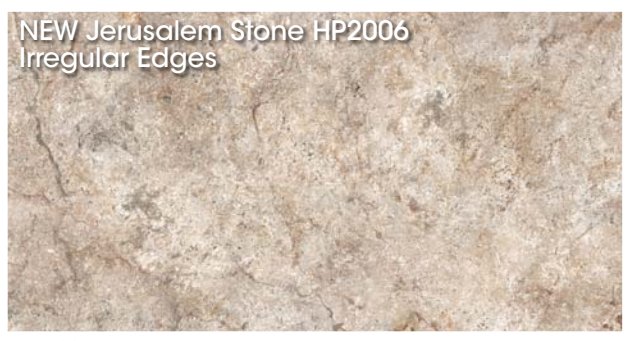
16" x 32" with Irregular Edges 1 cube = 48 pcs, 165.33 SF, 1545 lbs*