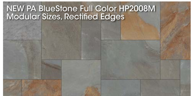
12" x 12", 12" x 24", 24" x 24", 24" x 36" with Rectified Edges** Four sizes packaged together in 1 cube. Sold in full cubes only. 1 cube = 60 pcs, 174.38 SF, 1645 lbs*

* The 24" x 48" Bluestone unit cannot be laid with the Bluestone Modular units.