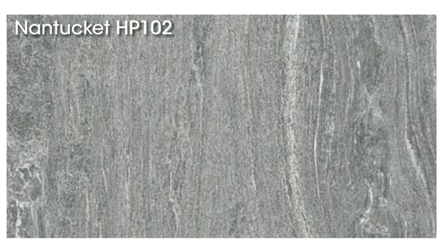
24" x 24" 1 cube = 64 pcs, 248 SF, 2335 lbs