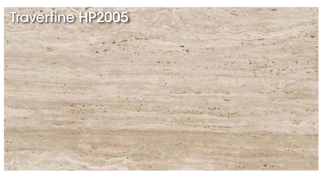
16" x 32" 1 cube = 48 pcs, 165.33 SF, 1545 lbs