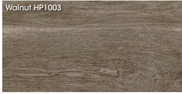
12" x 48" 1 cube = 48 pcs, 186 SF, 1725 lbs